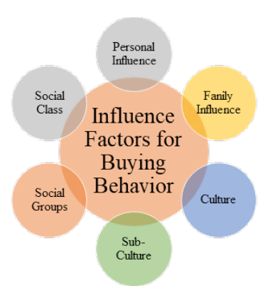
Figure 2: Influence factors for buying behavior

This is a crucial consideration if you are seeking to grasp client behavior. The "four Ps," which are "prizes," refer to consumer incentives. The status of the economy, technical advancements, the political atmosphere, and cultural standards all substantially affect consumers'