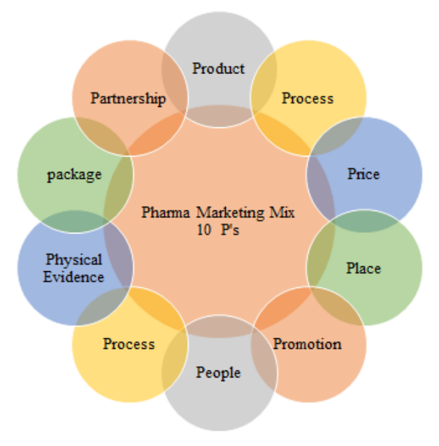
Figure 1: Pharmaceutical marketing mix

The product must take precedence since it is the focal point of the marketing mix (Figure 1). The health and social care services that integrated care providers give their customers are called their "products." Either a traditional integrated care product (such as a drug) or an enhanced integrated care product (such as a health app) can be used to promote, restore, or preserve a patient's health (such as scheduling assistance, follow-up calls, interest-free financing, or security measures like closed-circuit television and armed guards). Products enable the administration of business procedures.