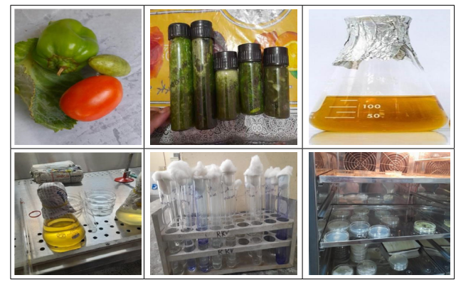
Figure 1: Sample collection and processing for isolation of bacteria from green vegetables.