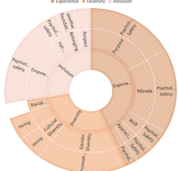
Figure 2: The proposed organizational model for fostering a safe and inclusive workplace

Diversity Culture can bring an edge to a high-performance culture. Gender diversity forms an important part of it.