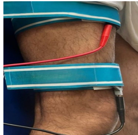
Figure 1: Placement of EMS electrodes

Subjects were randomly divided into two equal groups. One group performed exercise on a cycle ergometer first,