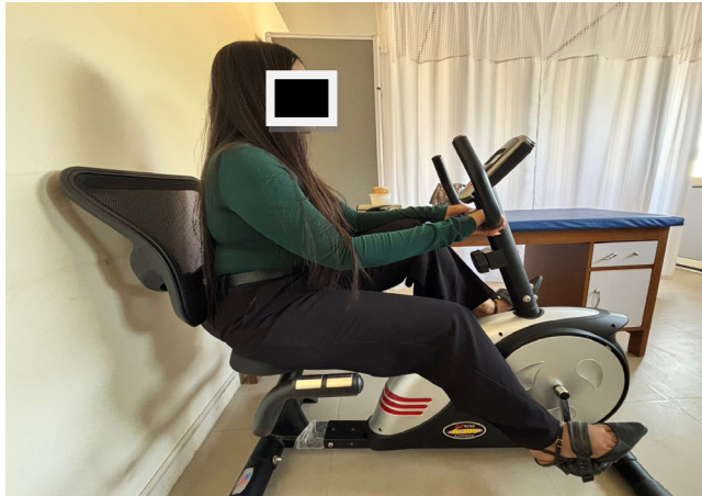
Figure 2: Cycle ergometer

quadriceps (Nussbaum et al., 2017). The stimulation intensity was adjusted to the tolerable limits of each subject. Surface rubber electrodes were placed bilaterally on the femoral triangle and the distal portion of the quadriceps femoris, secured with elastic band to ensure good contact.