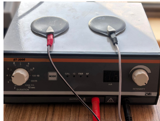
Figure 3: Modality used to stimulate the muscle

level score (185.5 ± 9.70) mg/dl. The post-treatment blood cholesterol level scores of cycling (185.23 ± 11.99) mg/dl were highly significantly different from the pre-treatment cholesterol score of cycling (186.8 ± 12.15) mg/dl. No significant differences were observed between the groups in pre-treatment and post-treatment cholesterol levels.